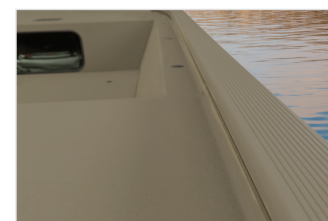
VERSATRACK® accessory-mounting channels