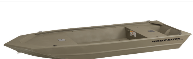
Photographs may be shown with optional equipment and/or aftermarket accessories.